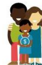
Income per Family